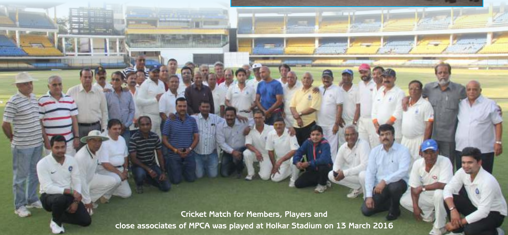
Cricket Match for Members, Players and close associates of MPCA was played at Holkar Stadium on 13 March 2016