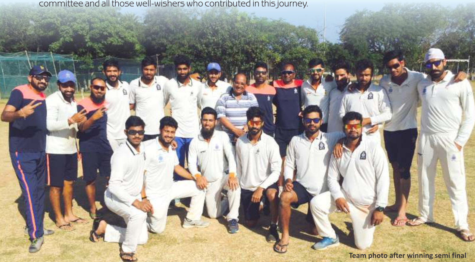
Team photo after winning semi final

It was a majestic performance by our team that played as a well-gelled unit till the end and has emerged as role-model. Heartiest congratulations to all players, coach and support staff, the selection committee and all those well-wishers who contributed in this journey.