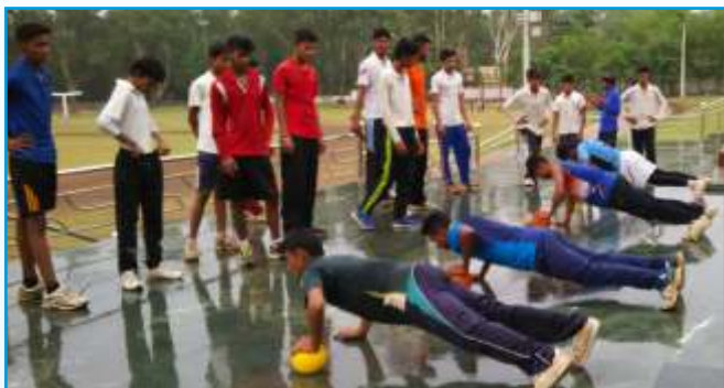
Shahdol : Off season conditioning camp underway