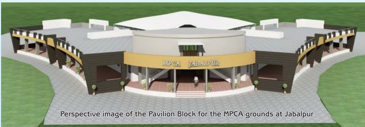
Perspective image of the Pavilion Block for the MPCA grounds at Jabalpur

Jabalpur : Jabalpur Division took up pilot project of implementing online scoring and integrated statistical display with professional support from a cricket social network service provider. With a positive feedback during the inter-divisional matches played at Jabalpur, JDCA is now planning to introduce this system on regular basis for its domestic matches as well.