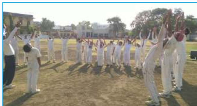
Ujjain : Sub-centre activity is functioning regularly and players appear to enjoy the variety of training imparted.

(pic) NDCA Officials greeting young players during U/15 District tournament.