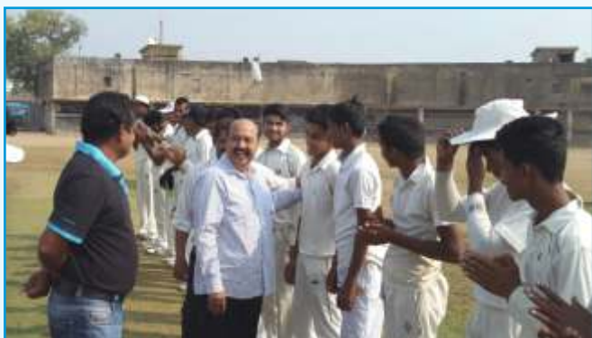
Narmadapuram : Narmadapuram Division conducted various activities and tournaments during the summer vacation.

(pic) NDCA Officials greeting young players during U/15 District tournament.