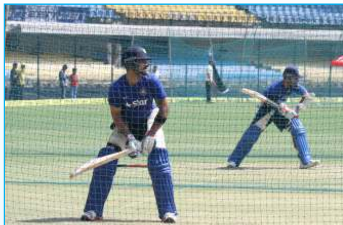
Indian players during practice session a day before the ODI