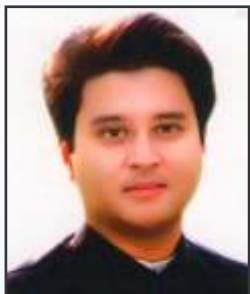
JYOTIRADITYA M SCINDIA Chairman, Finance Committee Member, IPL Governing Council Member, Disciplinary Committee