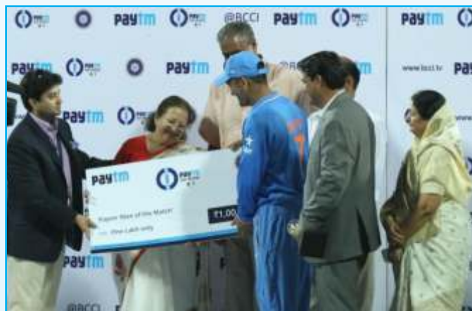
Man of the Match awards presentation