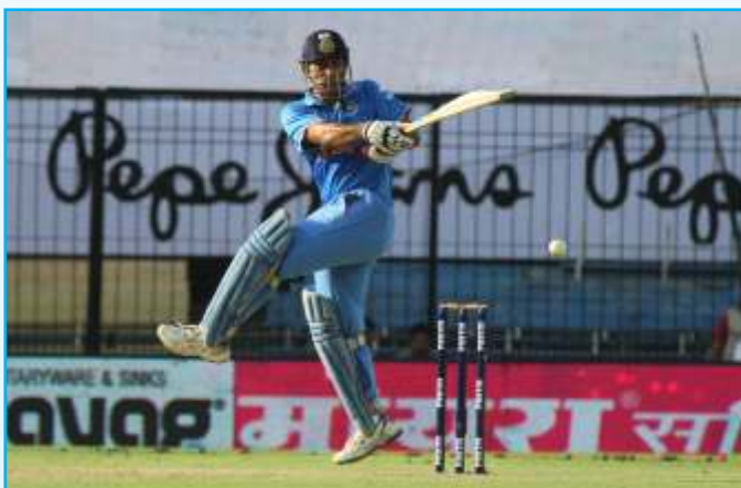
M S Dhoni in action