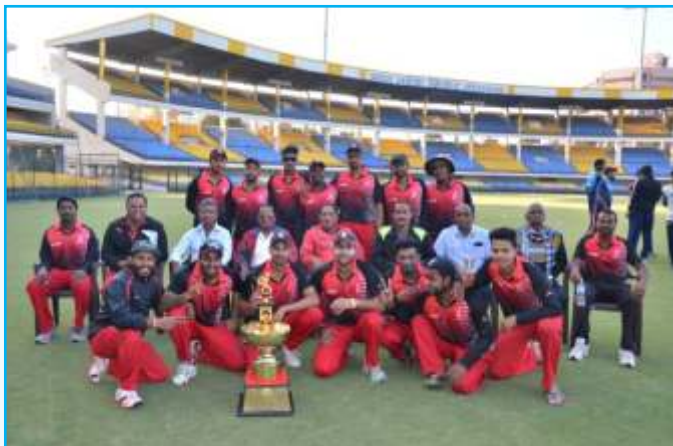
Madhavrao Scindia Trophy 2015-16

(Men's Sr. Inter Divisional Tournament - Ltd. Overs)