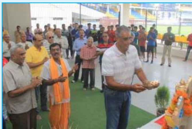
Ganesh Utsav was celebrated at Holkar Stadium.