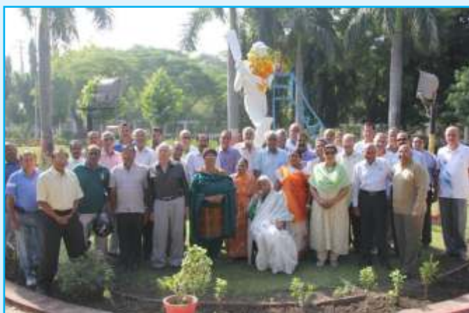
Col. C K Nayudu's birth anniversary was celebrated on 31 October 2015.

MPCA Calendar for 2016, illustrating the evolution of Holkar Stadium from a 'Club ground to a Test Centre', was unveiled on 26 January 2016.