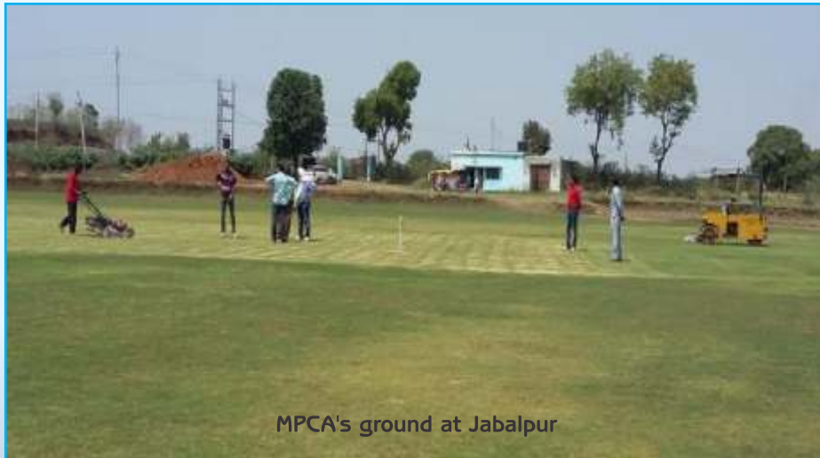
MPCA's ground at Jabalpur