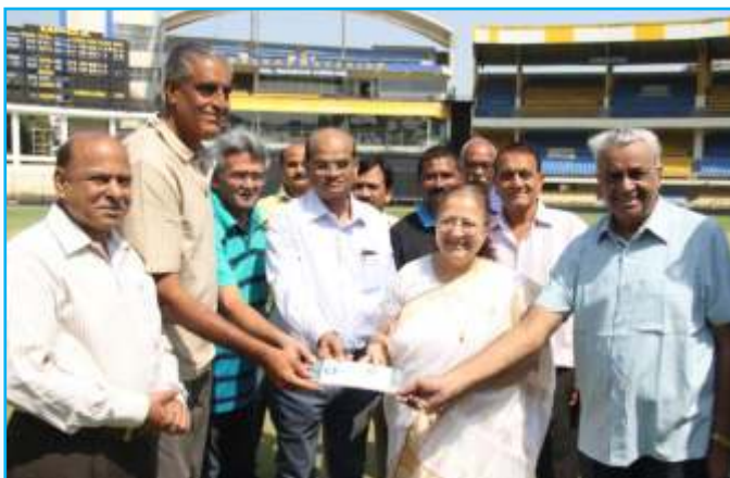
First ticket of the ODI was presented to Smt. Sumitra Mahajan (Hon'ble Speaker of Lok Sabha and Patron of ODI Organising Committee)