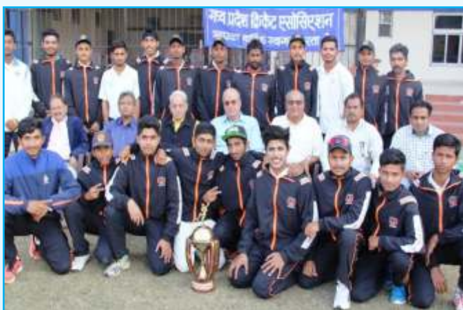
Heeralal Gaekwad Trophy 2015-16

(Boy's U/18 Inter Divisional Tournament - Multi Days)