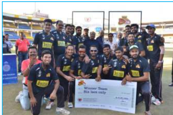
J N Bhaya Trophy 2015-16

(Men's Sr. Inter Divisional Tournament - T/20)