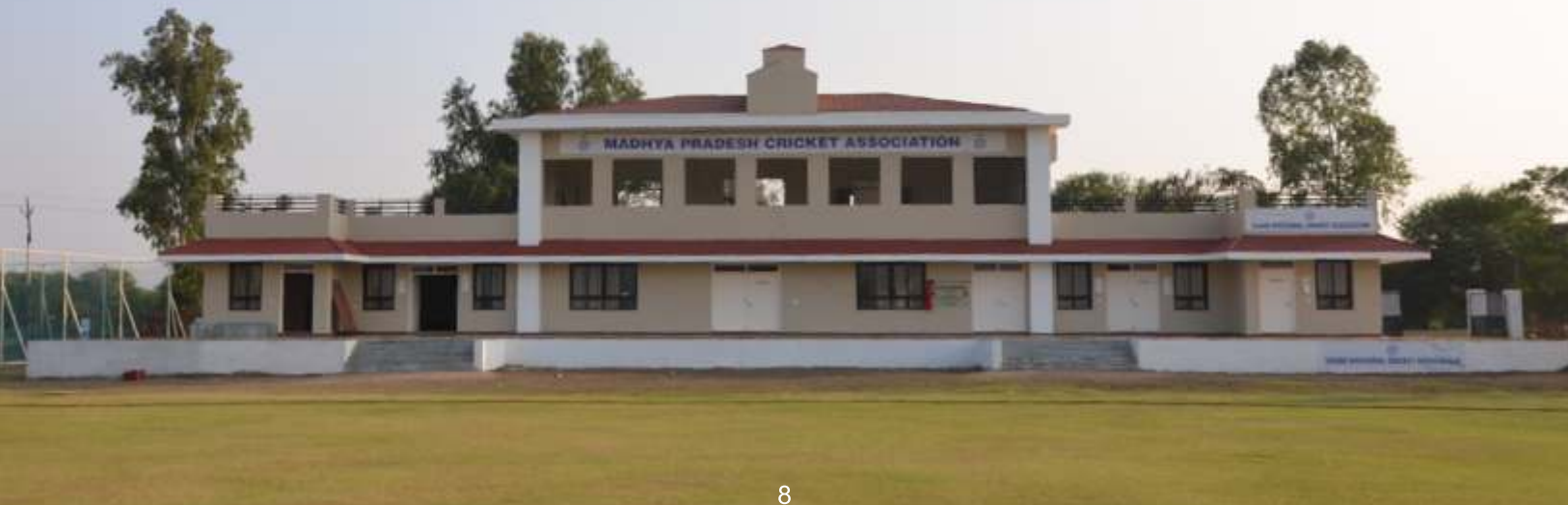
Pavilion block for MPCA's ground at Sagar.