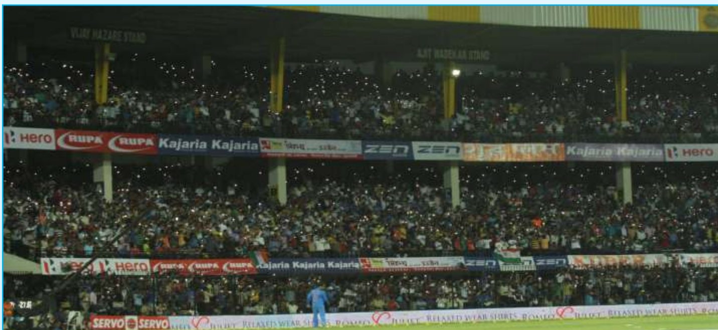
Indore crowd celebrated the majestic performance of Indian team by cheering the players with innovative 'flash light wave' using cellphones. Ab de Villiers acknowledged Indore crowd as "It was one of the best crowds I have ever played in front of. They helped their team get over the line."