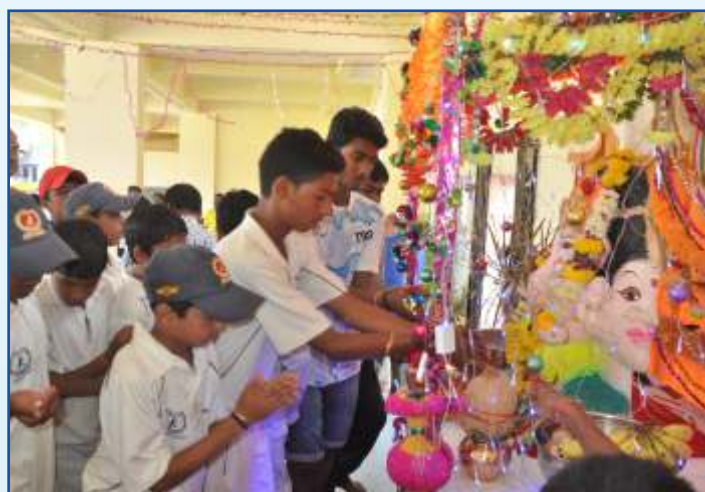
Players participate in the 'Ganesh Festival' at Holkar Stadium.