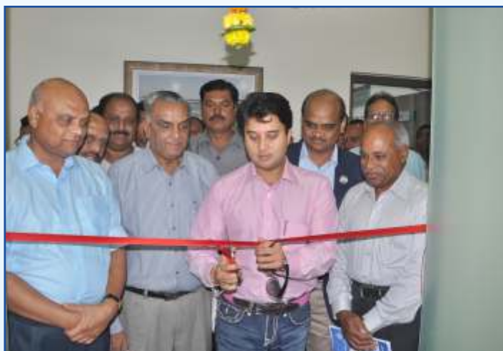
Mr. Jyotiraditya M. Scindia inaugurates the 'A W Kanmadikar Conference Hall' at MPCA Administrative Block on 23rd June 2013.