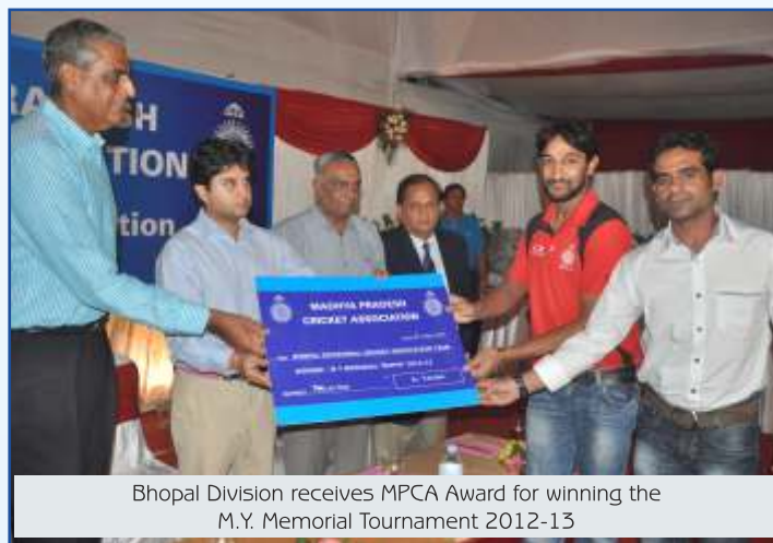
Bhopal Division receives MPCA Award for winning the M.Y. Memorial Tournament 2012-13