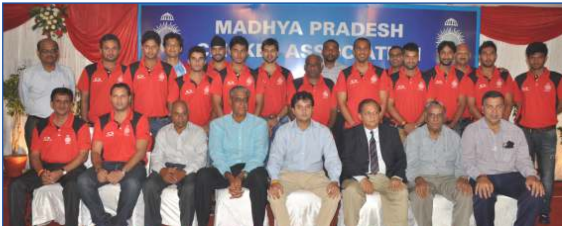
Men's Senior Team of MPCA