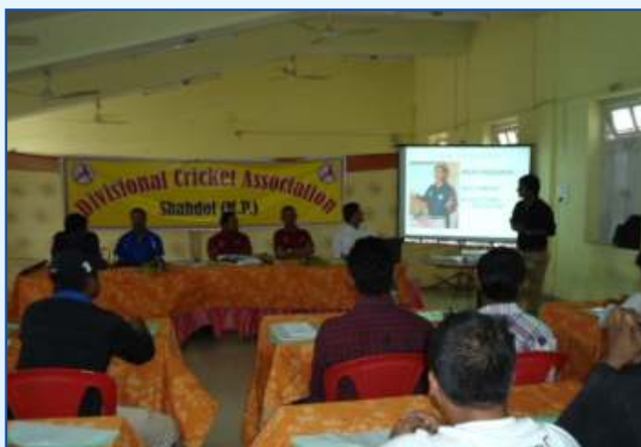
MPCA conducted a Level 'O' education course for cricket umpires and scorers at Shahdol Division.