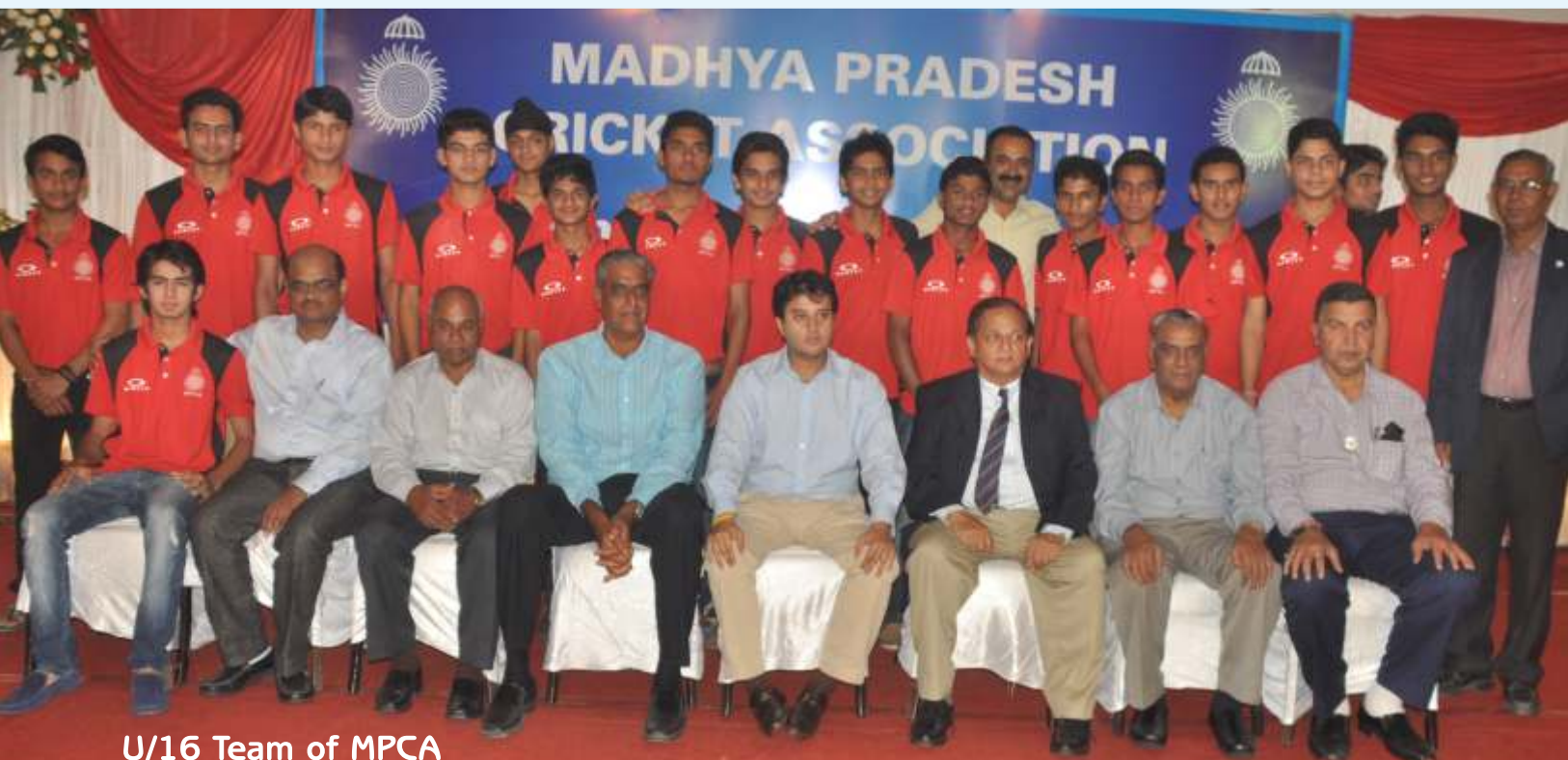
U/16 Team of MPCA

The ground staff attached to the Holkar Stadium (Indore) and Capt. Roop Singh Stadium (Gwalior) were rewarded for their excellent work which earned laurels for MPCA when BCCI adjudged us as the Best Association in the Central Zone for most sporting pitches and playfields for BCCI matches during 2012-13.