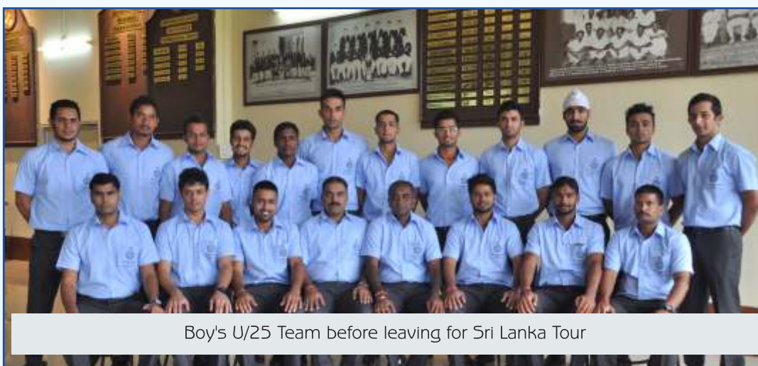
Boy's U/25 Team before leaving for Sri Lanka Tour