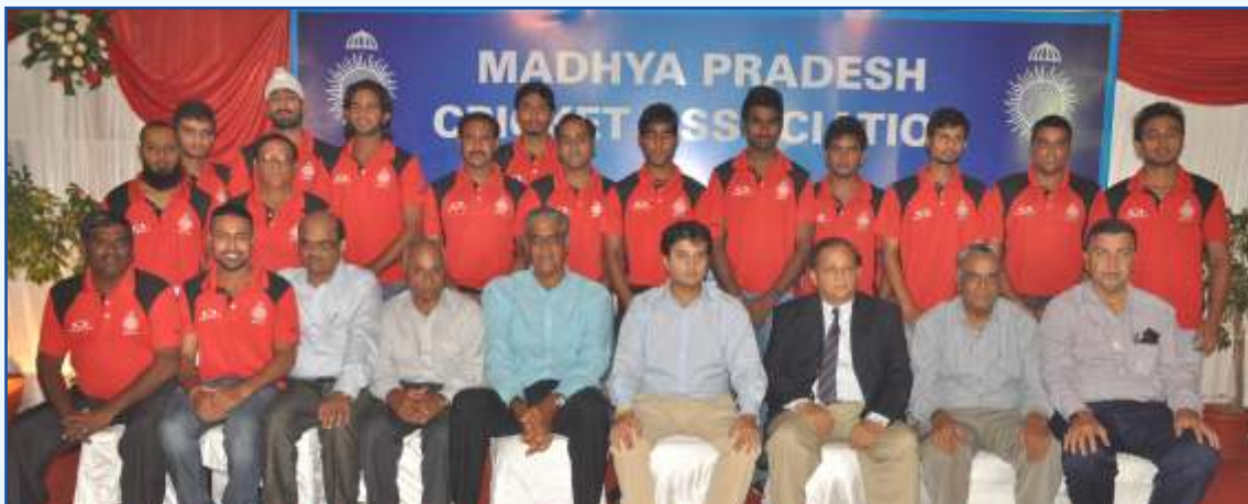
Boy's U/19 Team of MPCA