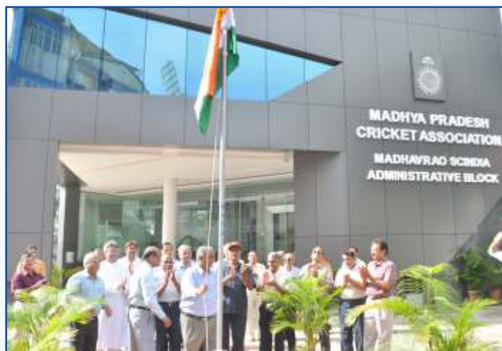
MPCA celebrates Indian Independence Day at Holkar Stadium on 15th August 2013