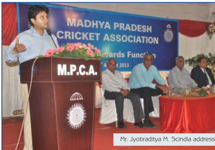
Mr. Jyotiraditya M. Scindia addressing the invites for the awards function.