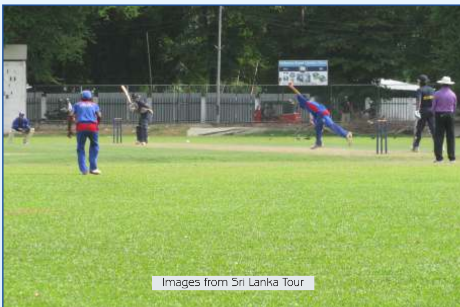
Images from Sri Lanka Tour