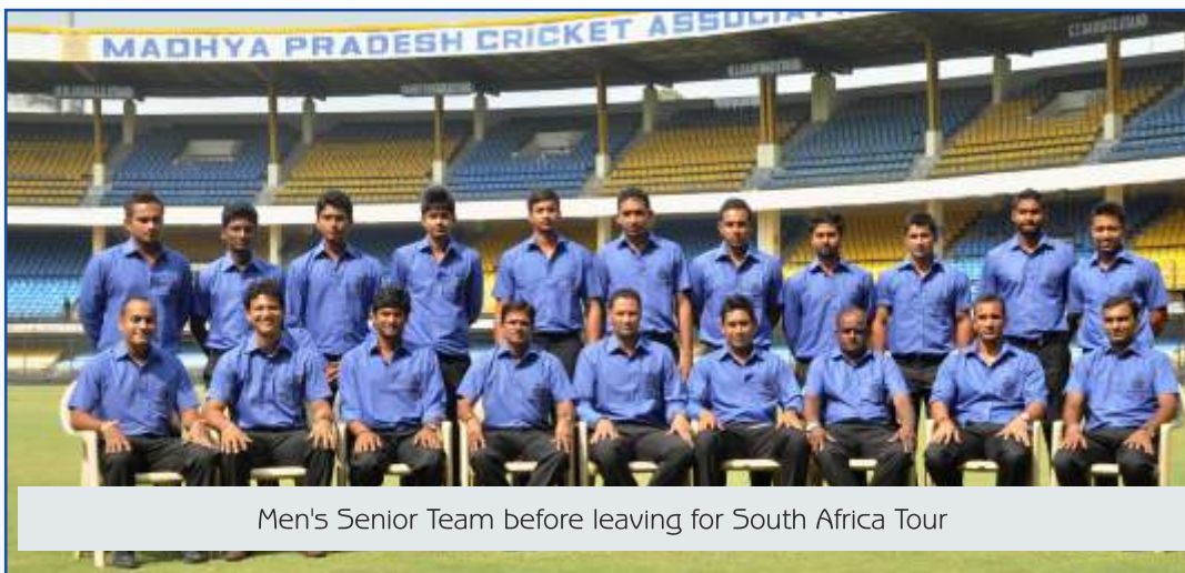
Men's Senior Team before leaving for South Africa Tour