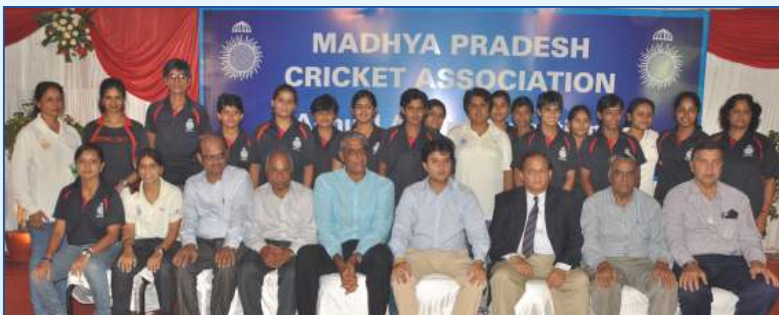
Women's Senior and Girl's U/19 Team of MPCA.