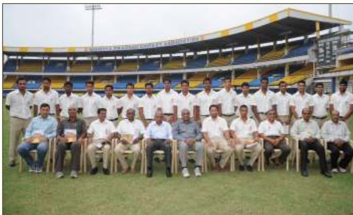
Men's Senior Team (July - August 2012)

We won the multi-day match series 3-0, Ltd. Overs 2-1 and T/20 2-1