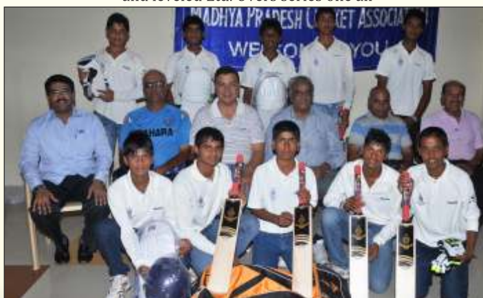
Young players under our 'Continuous Training Scheme' with the new Cricket Kit presented by MPCA.