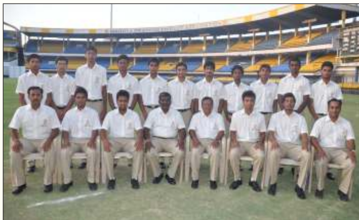
Boy's U-19 Team (May - June 2012)

We won the multi-day match series 3-0, Ltd. Overs 2-1 and T/20 2-1