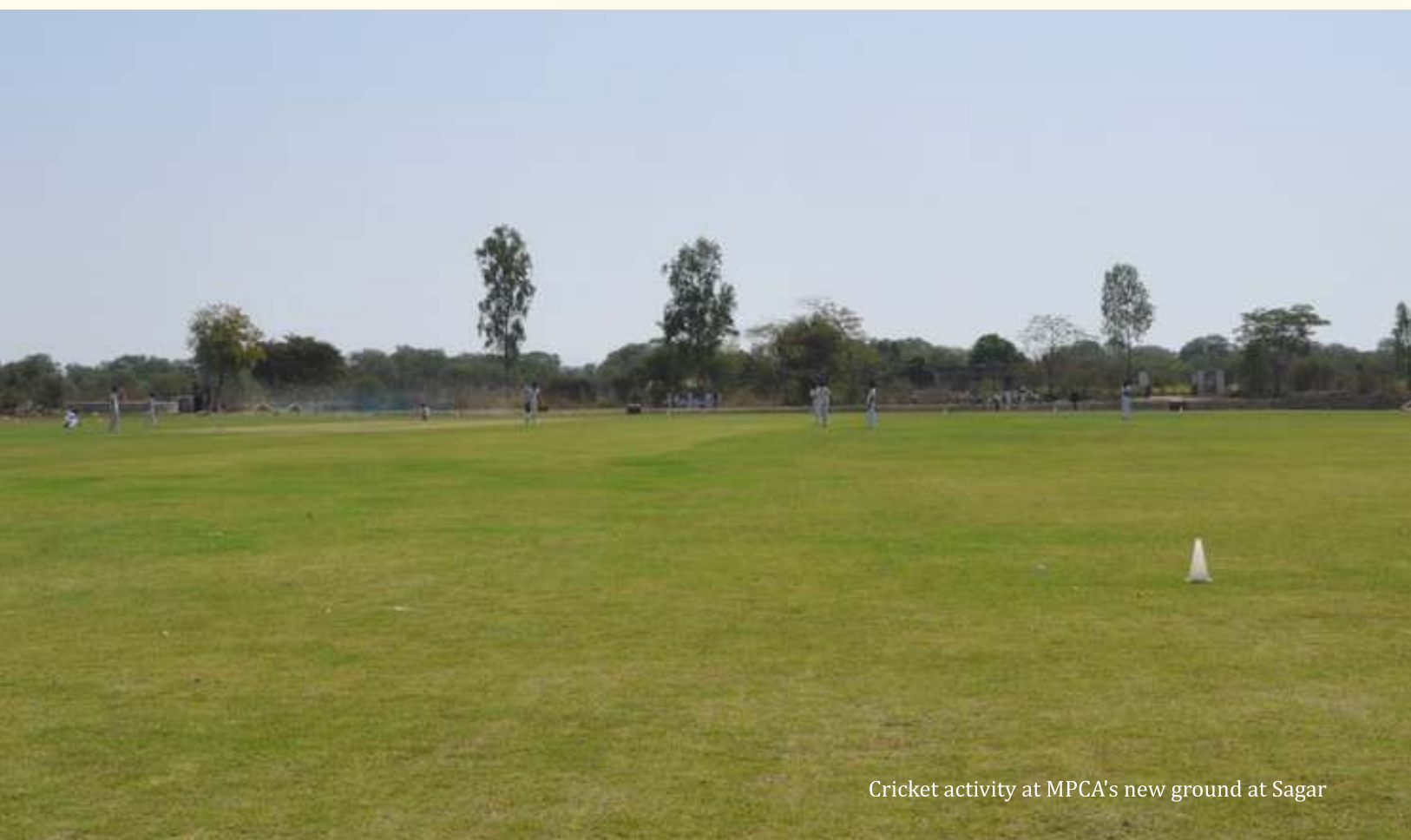
Cricket activity at MPCA's new ground at Sagar