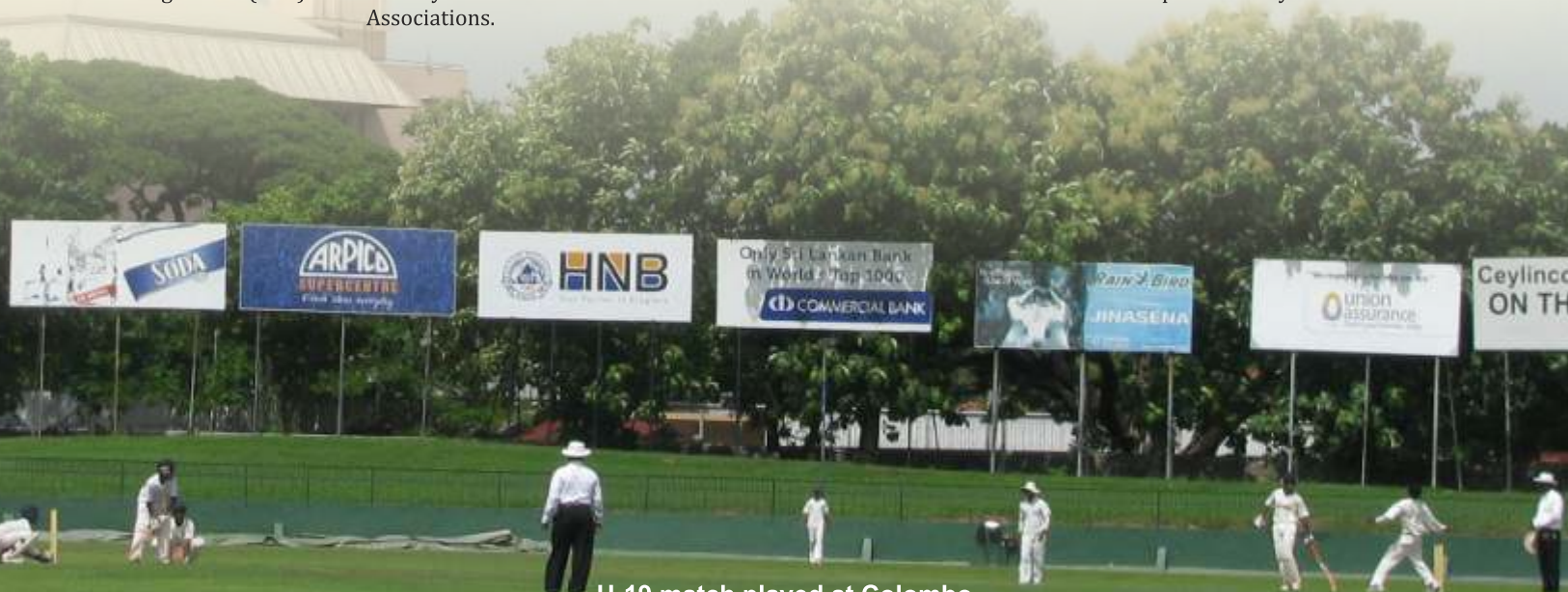
U-19 match played at Colombo