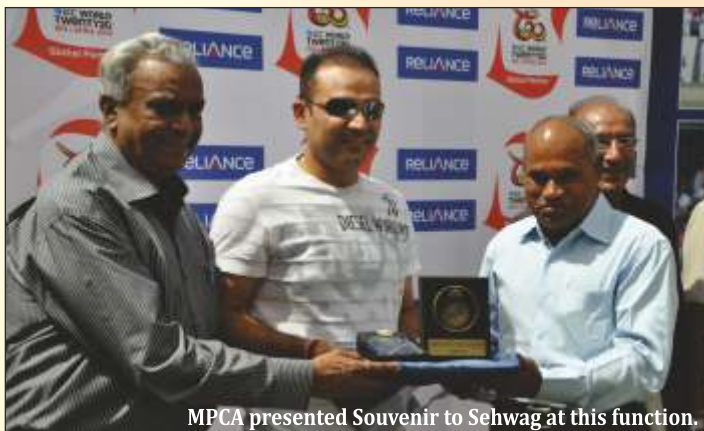
MPCA presented Souvenir to Sehwag at this function.

Sehwag fondly relived his World Record knock of 219 Runs when he was at Holkar Stadium the last time on 8th December 2011 for ODI against West Indies.