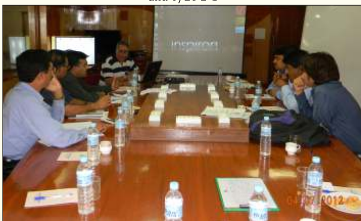
Education Course on the newly introduced Age Verification Programme (AVP) conducted by the BCCI for the Central Zone Associations.

We won the multi-day match series 2-0 (one game ended without result) and leveled Ltd. Overs series one all