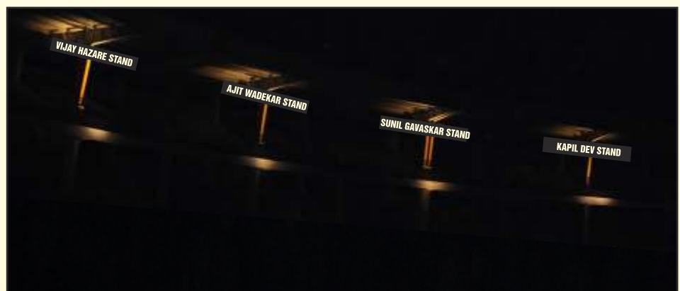
The stands at the Holkar Stadium, Indore being christened at a ceremony on 2 Nov. 2011. MPCA is widely appreciated for its gesture of recognizing past and current cricketers on merit.