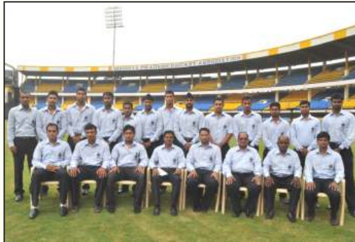
The MP senior team which toured Sri Lanka.