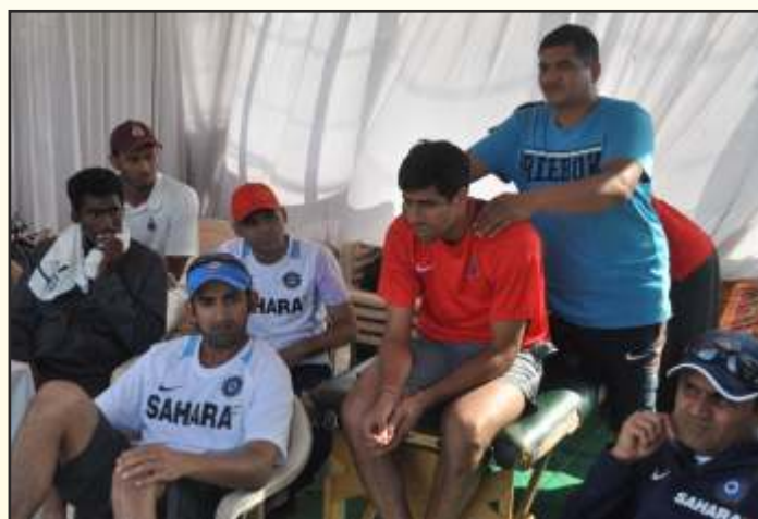
India stars Virendra Sehwag and Gautam Gambhir took time off from national duties to watch Delhi play in the Ranji Trophy match against MP at the Emeralds Height International Ground.