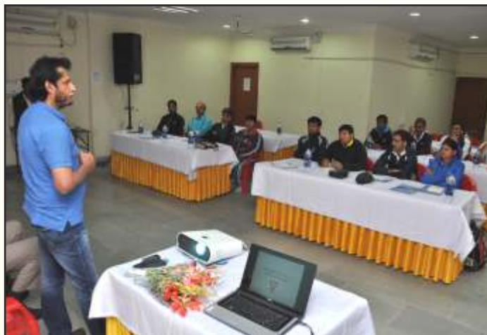
Sandeep Patil , Director of National Cricket Academy addressing the level A coach aspirants.