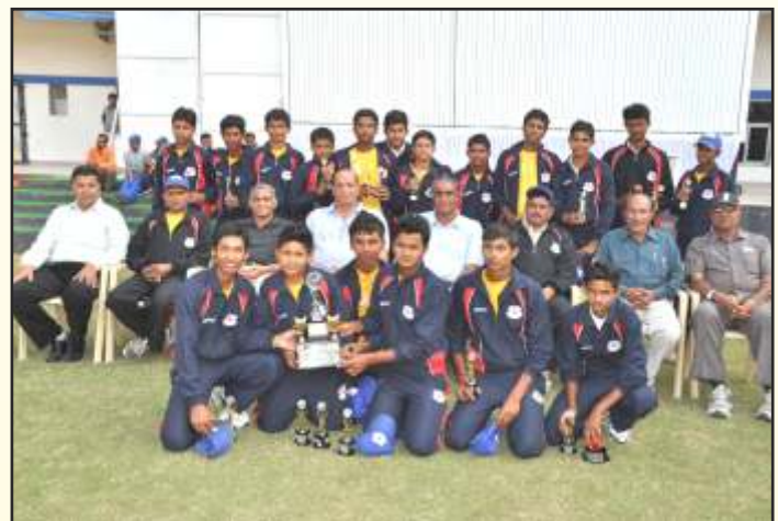
Uttar Pradesh lads with the Raj Singh Dungarpur Trophy, the U-14 tournament initiated by MPCA.