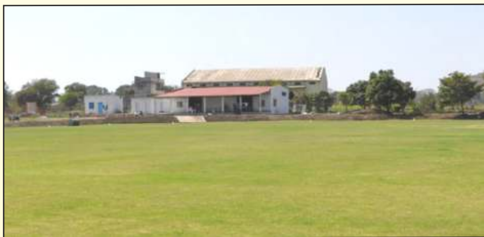
MPCA Ground at Sagar is now almost ready.