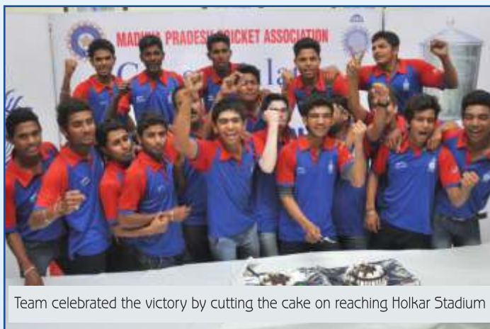
Team celebrated the victory by cutting the cake on reaching Holkar Stadium