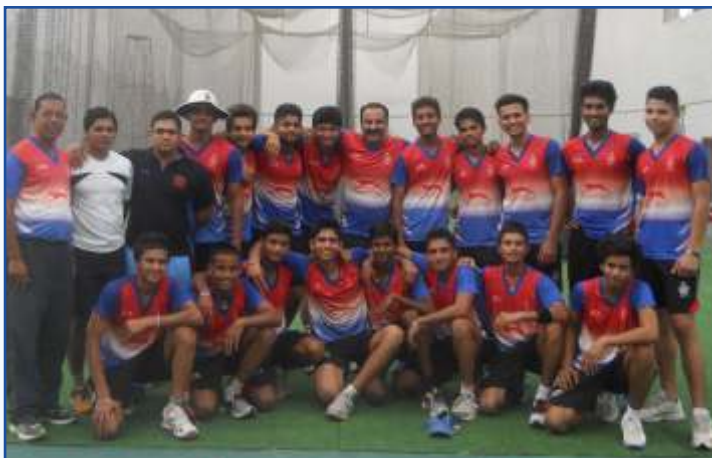
MP U/16 team during the Bangladesh Tour in Oct. 2013