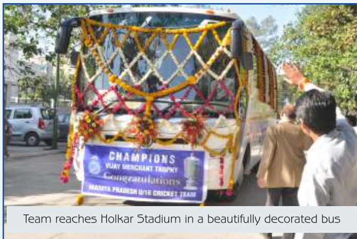
Team reaches Holkar Stadium in a beautifully decorated bus

It was a grand celebration at Indore when the team arrived after the victory. MPCA Officials, Members, Cricketers, Media representatives, parents & relatives of the players, and various associates of Madhya Pradesh Cricket were eager to receive the team and applaud them for the heroic performance. Senior cricketers and Members were seen praising the players and showered blessings for their continuous performance which will help them excel in their cricketing career.