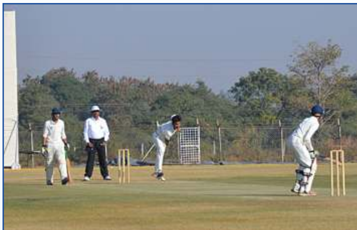
U/16 match between Madhya Pradesh and Vidarbha hosted by MPCA at the picturesque ground at Sagar