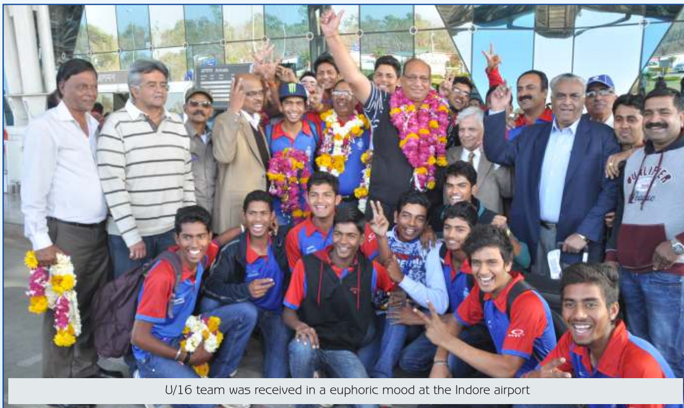
U/16 team was received in a euphoric mood at the Indore airport