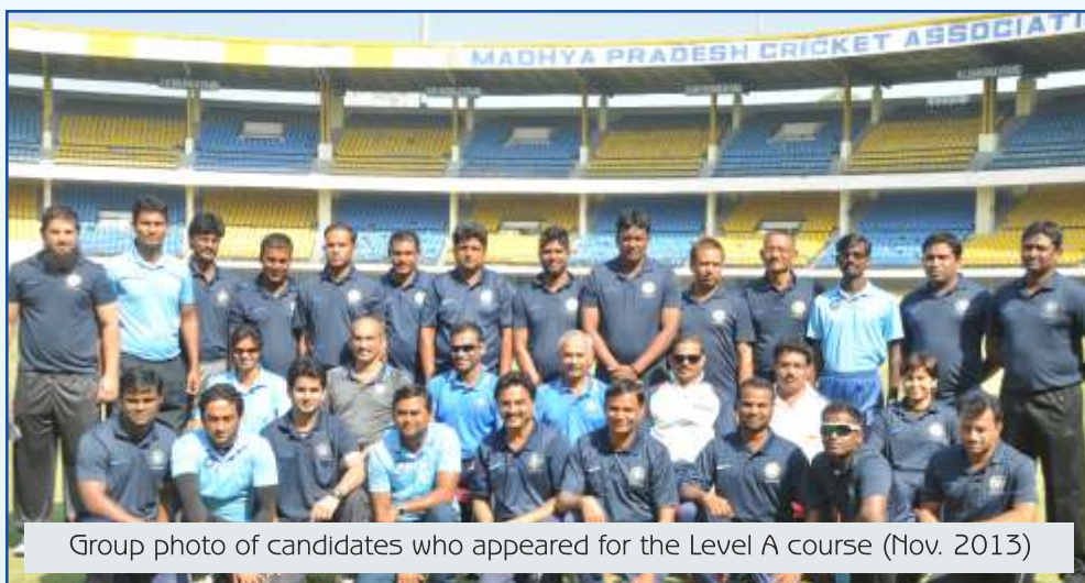
Group photo of candidates who appeared for the Level A course (Nov. 2013)