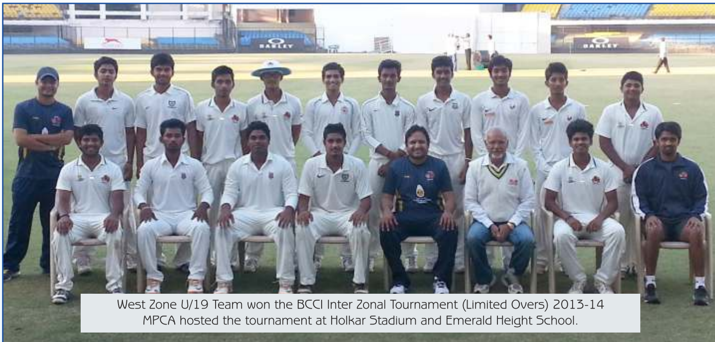
West Zone U/19 Team won the BCCI Inter Zonal Tournament (Limited Overs) 2013-14 MPCA hosted the tournament at Holkar Stadium and Emerald Height School.