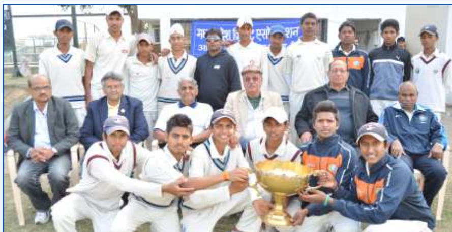
Rest of MP team won the U/15 Inter Divisional tournament for the 'M M Jagdale Trophy' 2013-14