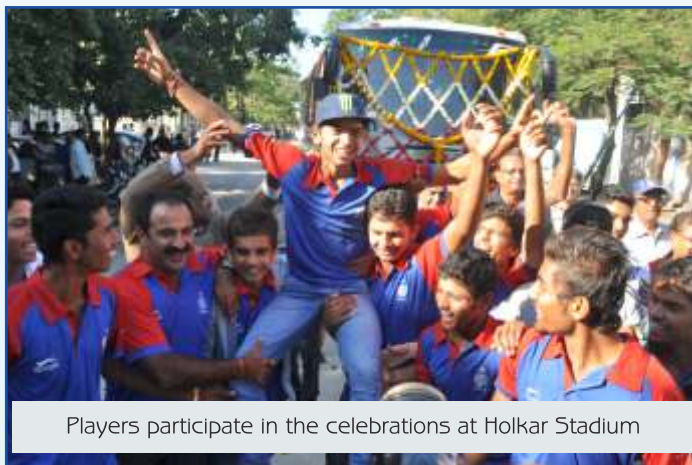
Players participate in the celebrations at Holkar Stadium