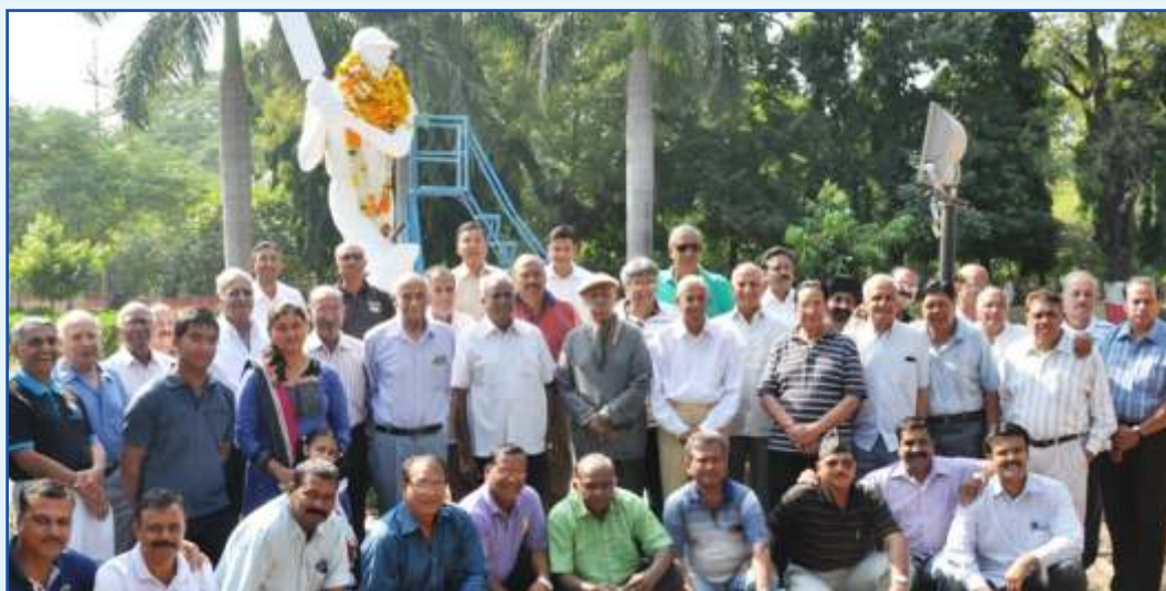
31 Oct. 2013 - MPCA commemorated the 118th Birth Anniversary of Col. C.K. Nayudu by garlanding his statue at the Nehru Stadium, Indore