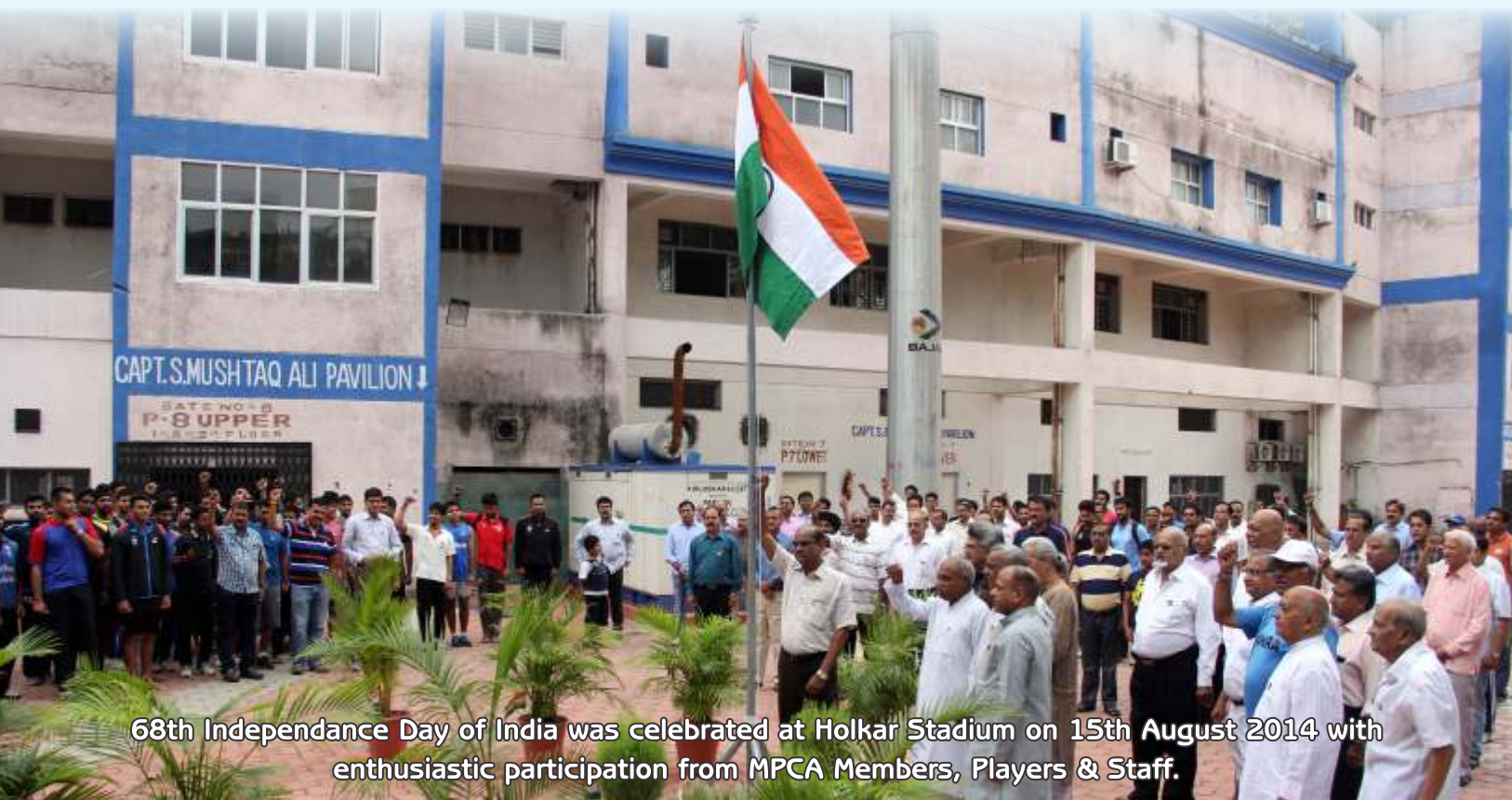
68th Independence Day of India was celebrated at Holkar Stadium on 15th August 2014 with enthusiastic participation from MPCA Members, Players & Staff.

This certification requires us to continue with the good systems and procedures that we have designed. Our journey ahead is equally challenging but our unified efforts would help us sail through.