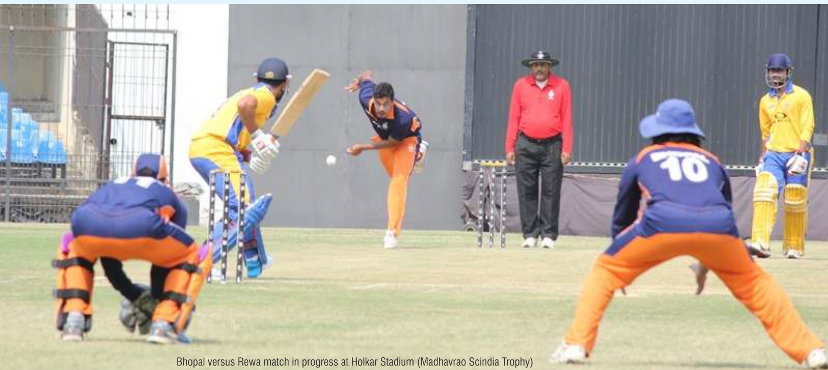
Bhopal versus Rewa match in progress at Holkar Stadium (Madhavrao Scindia Trophy)