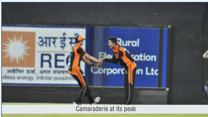
Camaraderie at its peak