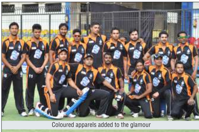
Coloured apparels added to the glamour