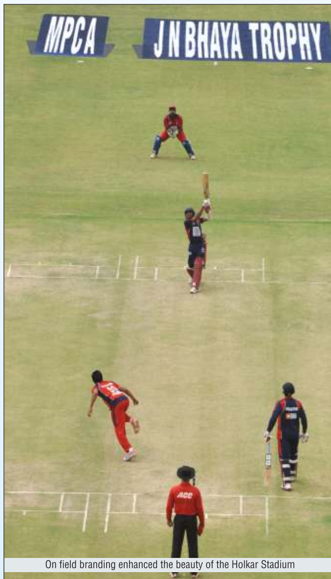
On field branding enhanced the beauty of the Holkar Stadium