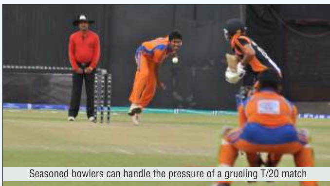
Seasoned bowlers can handle the pressure of a grueling T/20 match