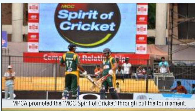
MPCA promoted the 'MCC Spirit of Cricket' through out the tournament.