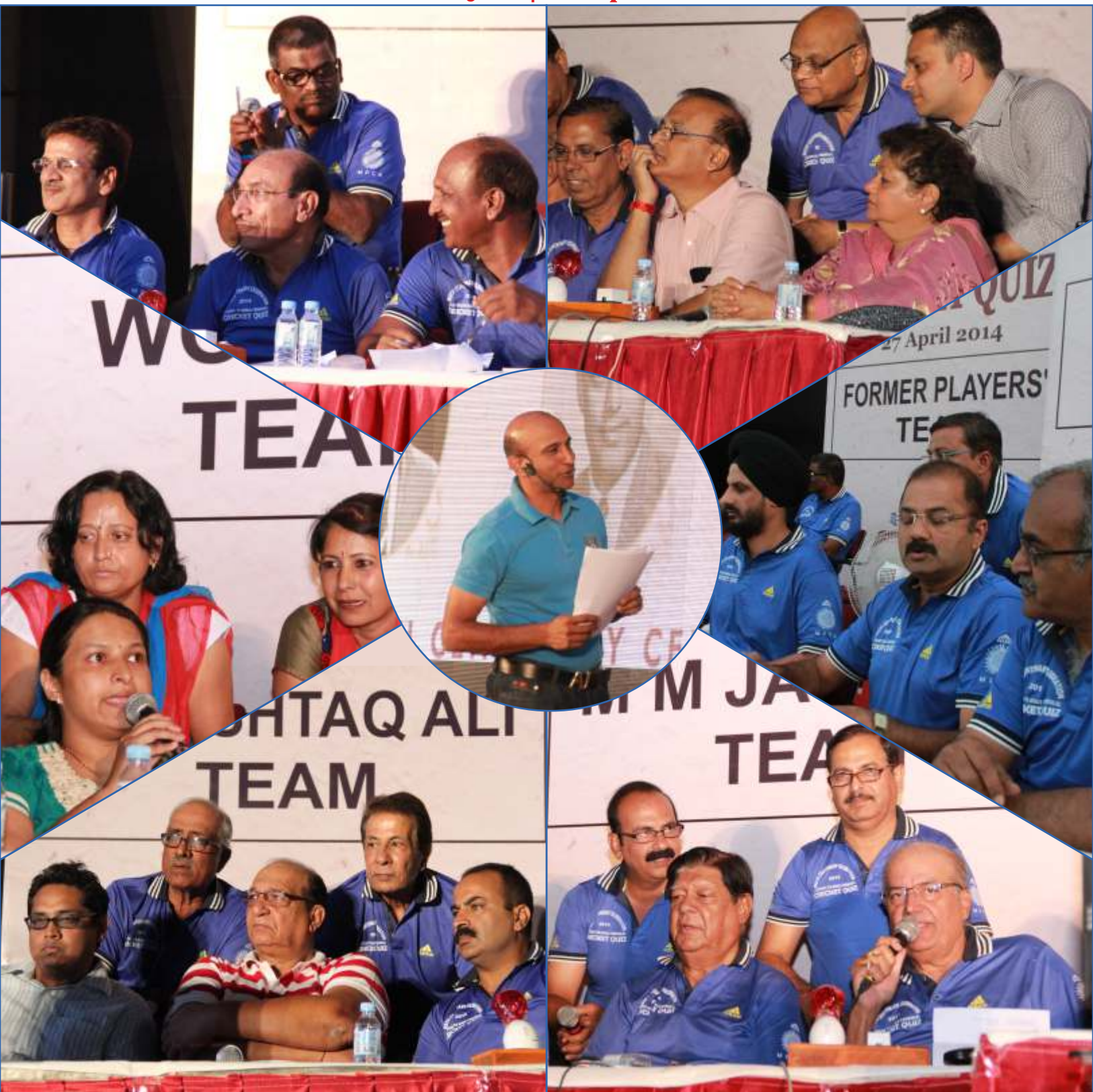
Six Teams and the Quiz Master