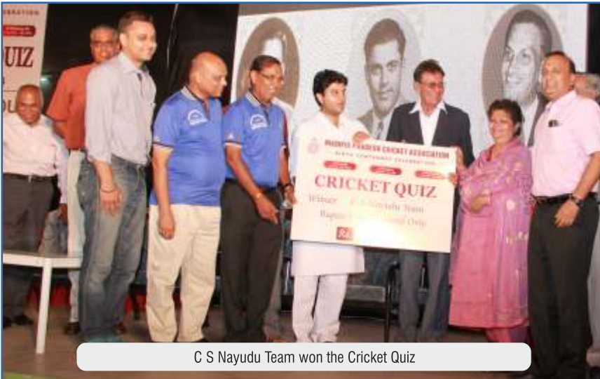
C S Nayudu Team won the Cricket Quiz