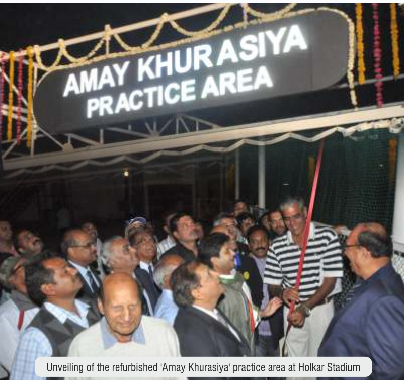
Unveiling of the refurbished 'Amay Khurasiya' practice area at Holkar Stadium