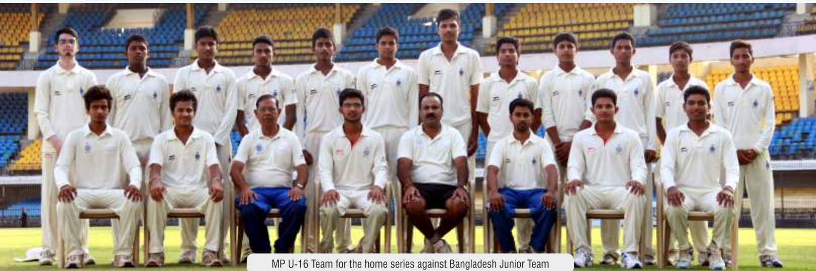
MP U-16 Team for the home series against Bangladesh Junior Team

Bangladesh Jr. team was invited by MPCA for practice matches during May & June 2014. The series comprised of four 3-day matches between the two teams played from 27th May to 11th June 2014. All the matches were played at Holkar Stadium. Both the teams gained precious experience from the matches. The visiting Bangladesh team appreciated the pitches, field and other amenities and hospitality extended by us.