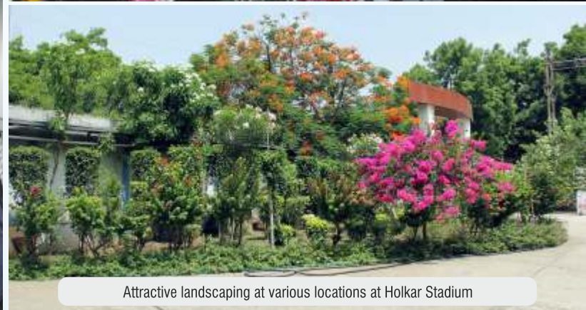
Attractive landscaping at various locations at Holkar Stadium