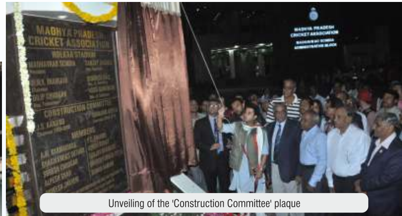
Unveiling of the 'Construction Committee' plaque