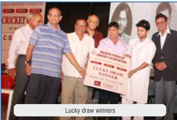
Lucky draw winners